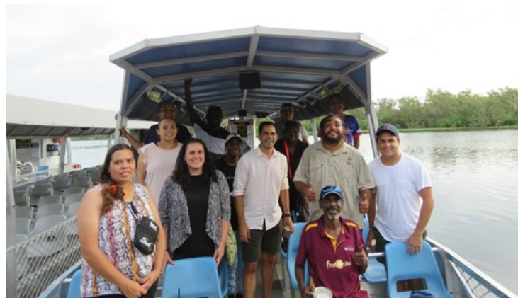
Experiencing an Aboriginal Business, Yellow Waters Cruise

The May workshop was to be the final of the four workshops that the First Circles members have been undertaking, which would have included a special meeting with NT Cabinet members, along with a leadership recognition reception.