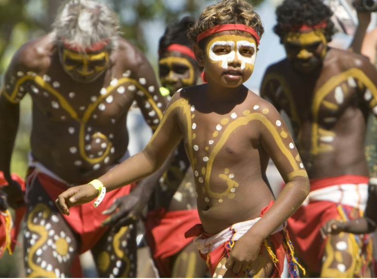
Barunga Festival