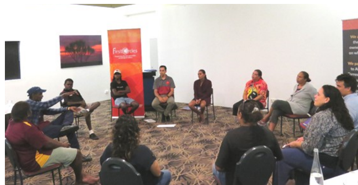
Day one members coming back together and checking in